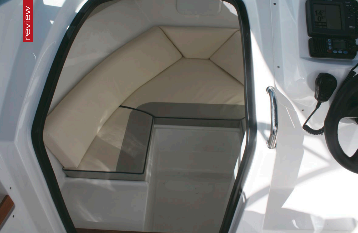
TOP: THE 600TT BOASTS QUITE A LARGE CABIN. PLENTY OF ROOM FOR GEAR STORAGE.