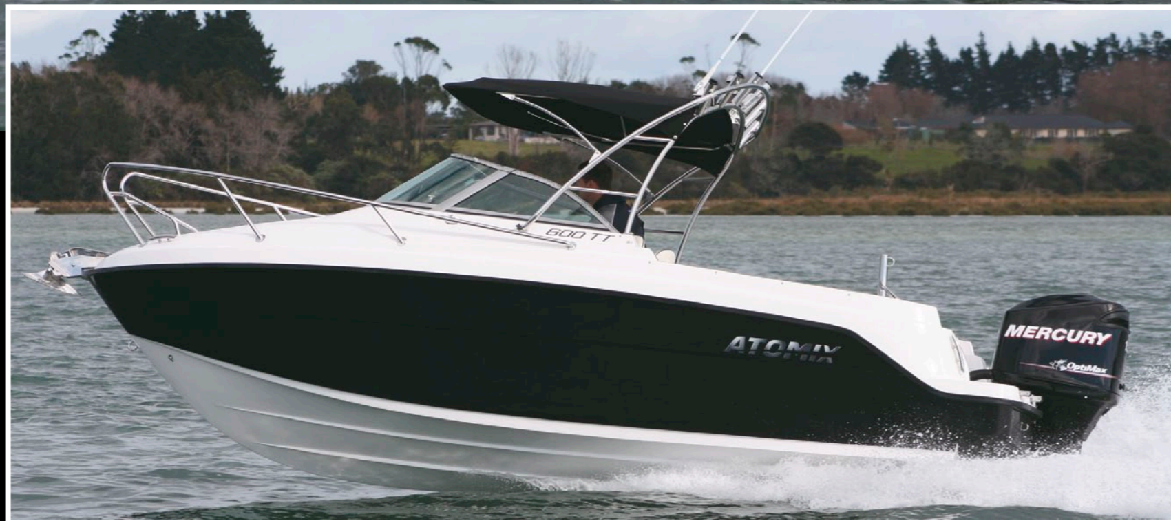
THE 150HP MERCURY OPTIMAX REALLY AIDS THE BOAT IN GETTING OUT OF THE WATER.

Having tested two of the very first Atomix models in 2006, an 820 Centre Console, and an 820 Weekender, I was pleased to see that a lot of improvements, particularly with regard to finish, have been made.